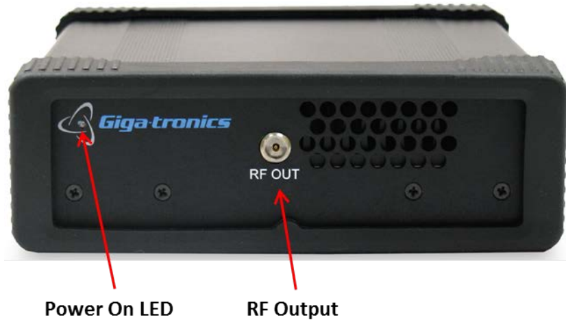
Figure 1: GT-1050B Front Panel

The following pages describe all of the features shown in Figure 1 and Figure 2.