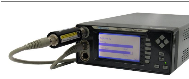
Figure 1: Setup for Sensor Calibration

NOTE: There are alignment marks (arrows) on the sensor and attenuator. To reduce measurement uncertainty, align the arrows when reconnecting the attenuator to the sensor.