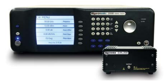
GT-1050A 50 GHz Microwave Power Amplifier and 2550B Microwave Signal Generator