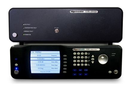
GT-1000B 20 GHz Microwave Power Amplifier and 2520B Microwave Signal Generator

mismatch reflections become more problematic as the frequencies increase. These effects may be minimized by moving the long cable to between signal generator and amplifier (where the match is better, reducing reflections) and keeping the cable length short between amplifier and DUT to minimize the standing waves.